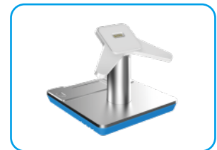
Magnetic Dock Stand